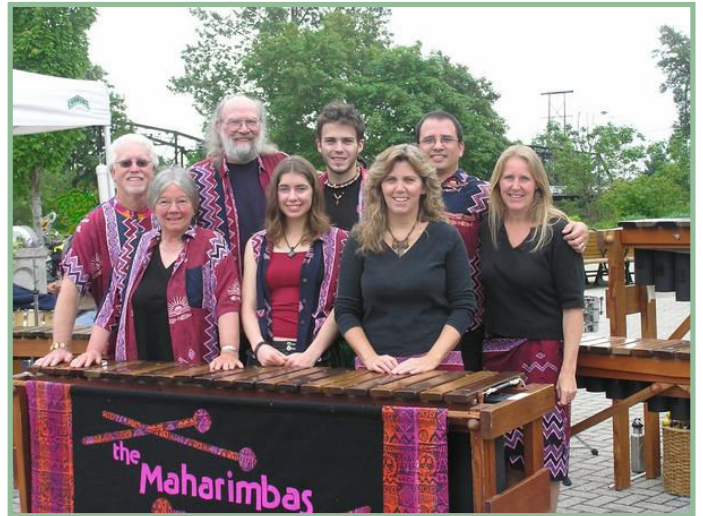
The Maharimbas will perform at this years Auction

Tickets for dinner, auction, and live music are $15 each before the event, or $20 @ the door (CWS families can purchase tickets for $20 per couple in advance only). They will be sold at the Corvallis Waldorf School office, Grassroots Bookstore, Cosmic Chameleon and Corvallis Brewing Co. A charity donation from the evening will be given to Stone Soup, a local soup kitchen feeding the hungry. Come have fun and support our exceptional Waldorf education in the Willamette Valley.