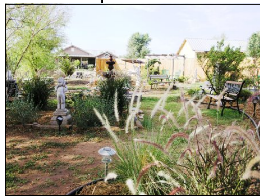
Garden August 2011

Rita's Garden has been a favorite location for visitors, retreatants, and the ministers for the past 14 years. The garden was started in 1997 in memory of little Rita Marie Huntzinger to celebrate and to thank God for what he has freely given. The first garden was made entirely of rose bushes and 1 eastern redbud tree and was built in a circular shape. In 2000 the garden was changed to remove the circular shape and add pathways, a small waterfall, benches, new trees and bushes including the introduction of lavender.