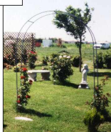
Garden May 1998

The 2011 renovation is a total redesign of every aspect of the garden. The new garden includes an additional 1000 square feet of plant beds and pathways, a large fountain, gazebo, additional benches, a new sidewalk and fence, and many new plants. At night the garden lights up offering a peaceful place to meditate and pray under the night sky. Whether you are coming to a retreat or are just in the neighborhood, we invite you come by and enjoy the blessings of the garden.