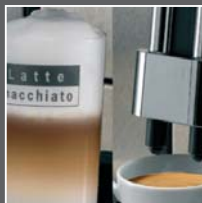
Consistent Shot Delivery