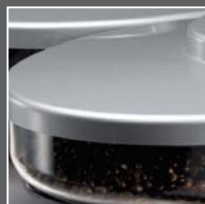
Dual Bean Hoppers