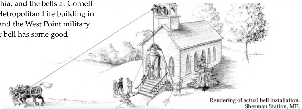
Rendering of actual bell installation. Sherman Station, ME.