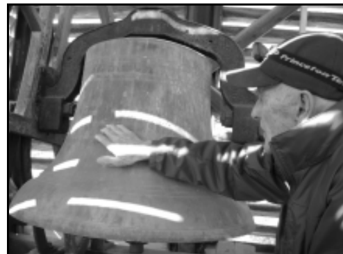
Don Potter pointing out the words cast on the bell, "Praise God from Whom All Blessings Flow."

We are grateful to these two crews, Don Potter