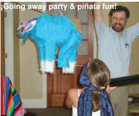
Going away party & piñata fun!