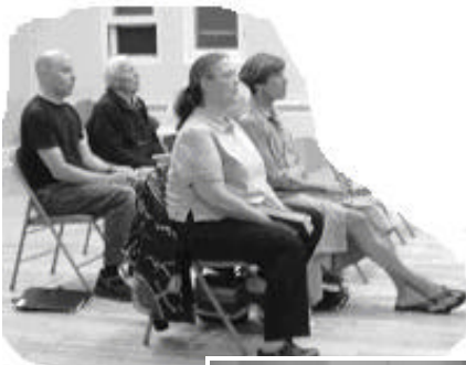
Thursday evening adult choir practice