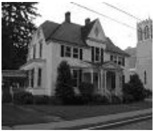
The Lewis House