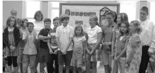
Acolytes commissioned during our Intergenerational service this past month.

In celebration of the Feast Day of St. Francis there will be a Community Service of the Blessing of the Animals on the Village Green at 4pm. Sponsored by St. James Church this service of the Blessing of the Animals is intended to give thanks to God, the Creator of all living things. After a brief time of worship, each family pet will be individually blessed. Favorite stuffed animals will also be blessed. Please join us, one and all, in this spirit of kinship and fellowship with all living things.