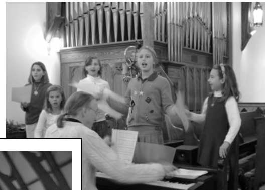
Children's choir rehearsal