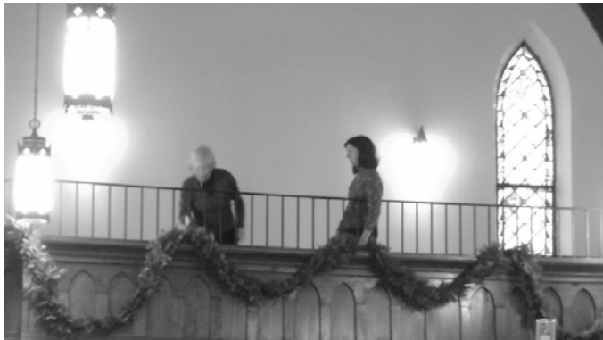
Greening the Church