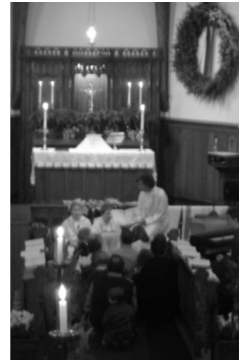
Children's Time, Christmas Eve