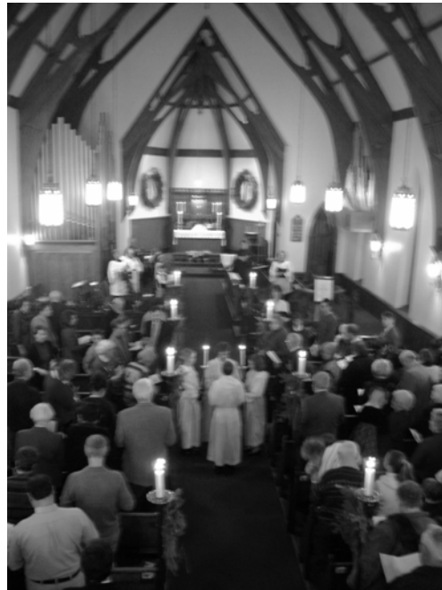
Christmas Eve family service, 2008