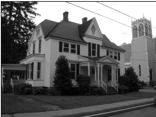
The Lewis House