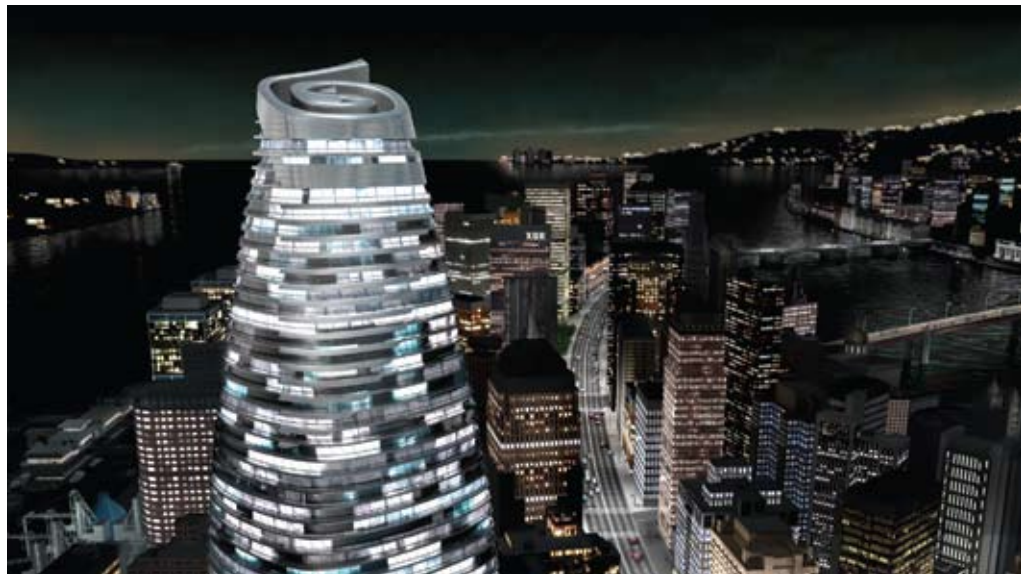
Model created by Spine3D