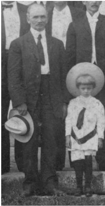
1907 Zion Centennial