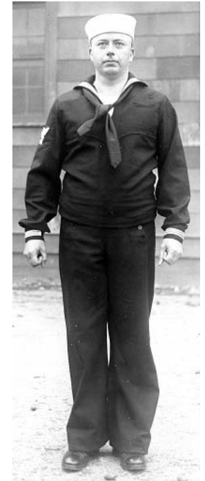
As a sailor in WWII