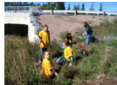
Mathieu-Martin students working hard during the Fox Creek's Tree Planting

1 January : What is your green resolution? Happy New Year!