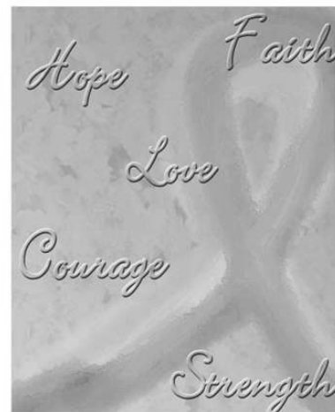
Cases of Breast Cancer Related to Age at Diagnosis

In order to fight against breast cancer and improve our outcomes, it is imperative that we put aside barriers to early detection. Some of these barriers include being “too busy”; fear or mistrust of the healthcare system, fear of the test itself, fear of the results; or a dislike of the whole healthcare process. Whatever the barrier is, God will help you through it if you give it to Him. He desires that we would cast our cares upon Him, because He cares for us! He promises never to leave us or forsake us, in health and in sickness. Nothing is too big for Him to handle. He is able! Be proactive in taking care of your body by seeking regular healthcare and early detection testing at the recommended times.