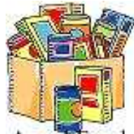
Angel Food Ministries

Now from the convenience of your own home, you can order Angel Food online at any time by logging on to www.angelfoodministries.com and pay with your debit or credit card. When ordering, it will ask for the Host ID # and location. Please type in Christ Lutheran Church as the location and the Host ID # is: 1769. Pick up will still be at Christ Lutheran Church on the monthly specified date. If you do not have your own personal computer, computers are free to use at your local library.