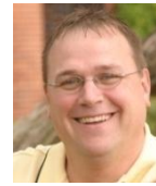
Youth News and Views