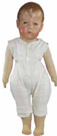
17" KATHE KRUSE "DOLL I" CLOTH DOLL, CIRCA 1920