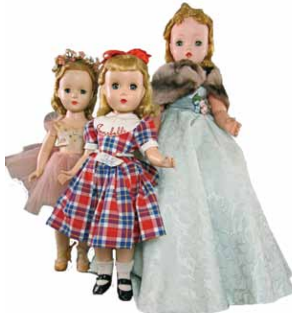
HARD PLASTIC MADAME ALEXANDER DOLLS, CIRCA 1950's