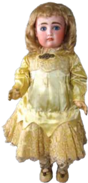
21" KESTNER "AT" ANTIQUE BISQUE DOLL