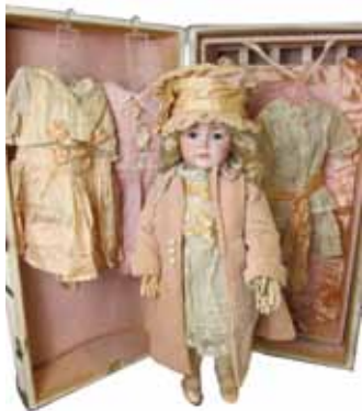
18" K*R #117 ANTIQUE BISQUE DOLL WITH WARDROBE

This will be a two ring, fast paced auction. Lunch available at Big Apple Café.