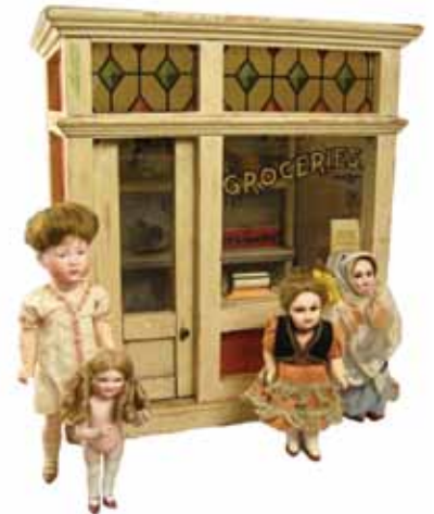
ANTIQUe GERMAN GROCERY STORE WITH ANTIQUe BISQUE SMALL DOLLS

BUYING OR SELLING INQUIRIES PLEASE CONTACT: