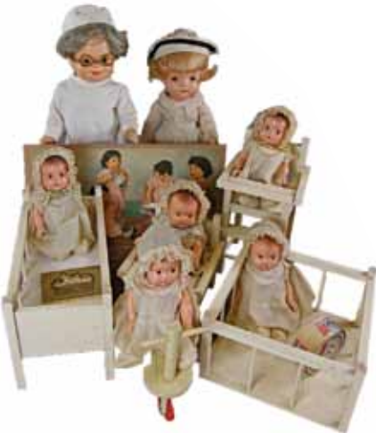
COMPOSITION MADAME ALEXANDER DIONNE QUINTUPLETS, DR. DAFOE & NURSE, CIRCA 1935-36