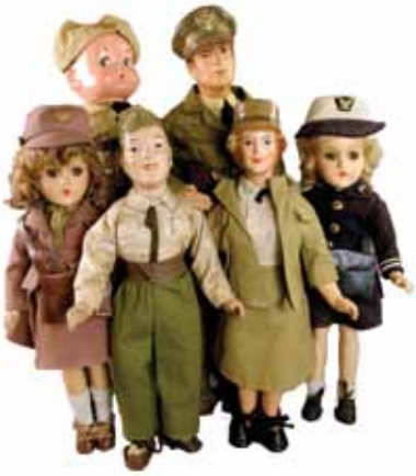
1930's-40's MILITARY COMPOSITION DOLLS