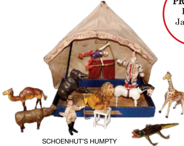
SCHOENHUT'S HUMPTY DUMPTY CIRCUS, EARLY 1900's