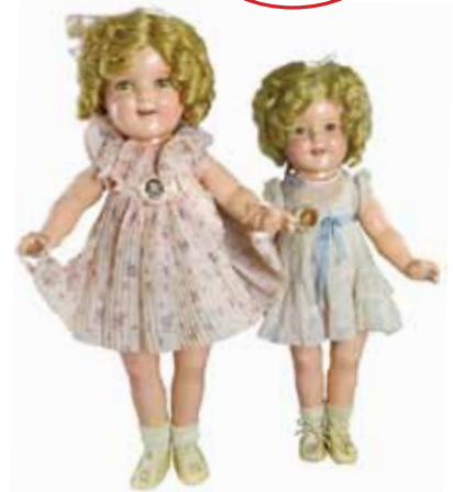
20" AND 18" COMPOSITION IDEAL SHIRLEY TEMPLE DOLLS

Online auction catalog and internet/absentee bidding available at www.McMastersHarris.com