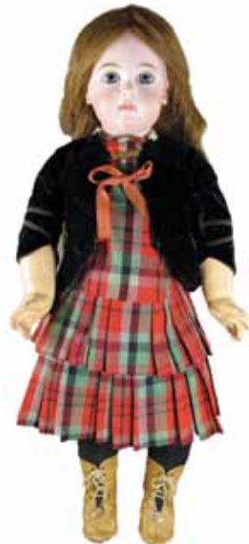
25" DEPOSE' JUMEAU BEBE' SECOND SERIES ANTIQUE BISQUE DOLL